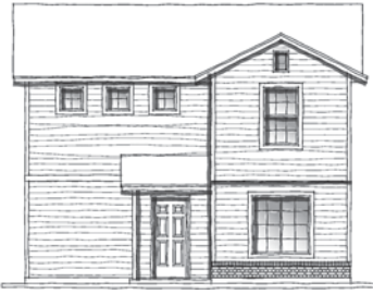
:: CLASSIC ELEVATION ::

ADDITIONAL OPTIONS (Options shown in smaller red dots, even if printed on a black & white printer)