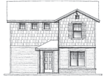
:: CRAFTSMAN ELEVATION ::