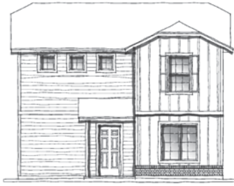
:: TRADITIONAL ELEVATION ::